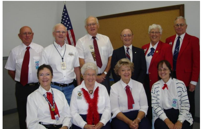
First Lady Donajean Sherwin