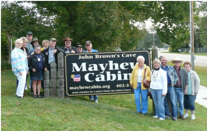
Tour of Mayhew Cabin, a stop on the Underground Railroad