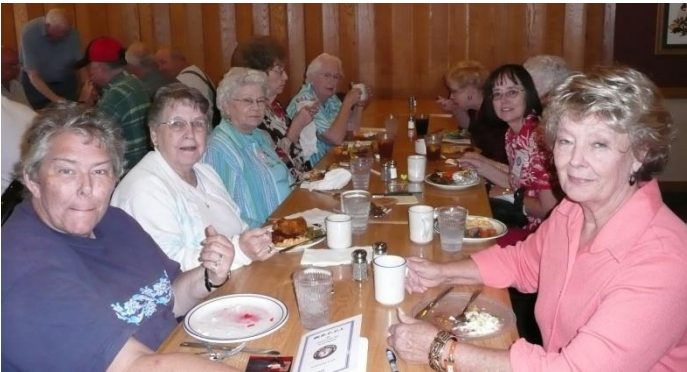
The Ladies' Table