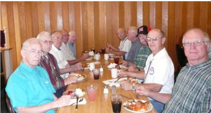
The Gentlemen's Table