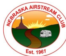
Nebraska Unit 50th Anniversary Logo

While bicycling on the Scenic Trail around Lake Okeechobee, the Suttons observed a rare Florida panther. We watched it for several minutes while it hunted at the edge of a marsh area. Of course, the camera was back in the truck!